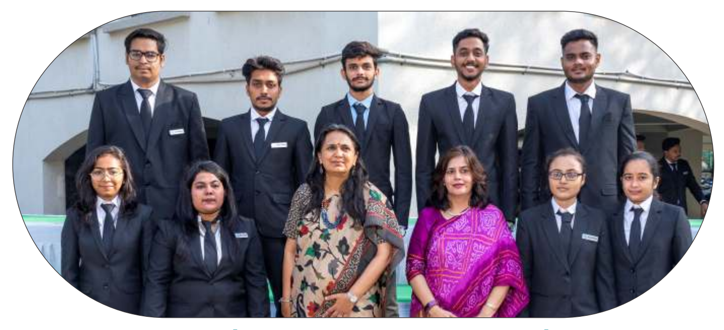
MBA (INFORMATION TECHNOLOGY)