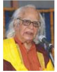
Dr. Yash Pal Padma Bhushan Former Chairman University Grants Commission, New Delhi Convocation - 2012