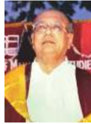
Shri. Sureshchandra Mehta Hon'ble Minister of Industries Government of Gujarat