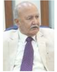
Hon'ble C. K. Buch Former Justice, High Court of Gujarat Convocation - 2018