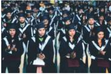
Shri Justice D.H. Waghela Former Chief Justice of Bombay High Court Convocation - 2017