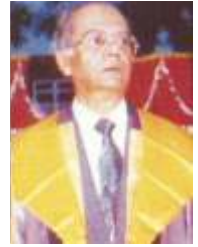
Shri Justice G.T. Nanavati Former Judge, Supreme Court of India