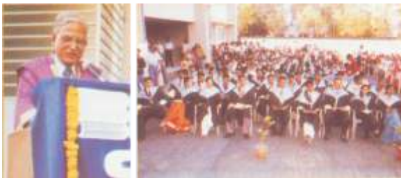
Shri Justice M. B. Shah Judge, Supreme Court of India, New Delhi Convocation - 2003