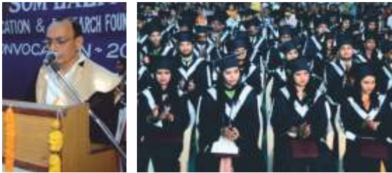
Shri Justice D.H. Waghela Former Chief Justice of Bombay High Court Convocation - 2017