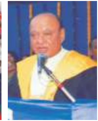
Shri Shankarsinhji Vaghela, Hon'ble Textile Minister, Government of India, New Delhi.