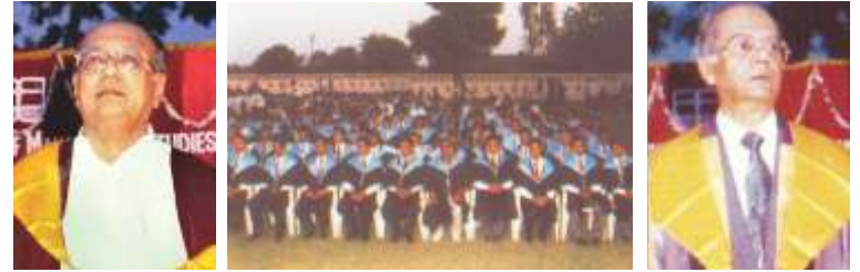
Shri. Sureshchandra Mehta Hon'ble Minister of Industries Government of Gujarat