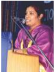
Smt. D. Purandareswaridevi Hon'ble Minister of State for HRD, Govt of India.