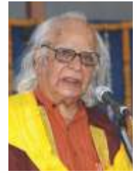
Dr. Yash Pal Padma Bhushan Former Chairman University Grants Commission, New Delhi Convocation - 2012