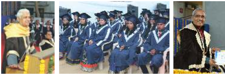
Hon'ble Justice Shri. Anil R. Dave, Former Judge, Supreme Court of India