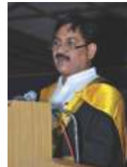
Shri. Bharatsinhji Solanki Hon'ble Minister of State for Power, Government of India, New Delhi.