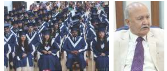
Hon'ble C. K. Buch Former Justice, High Court of Gujarat Convocation - 2018