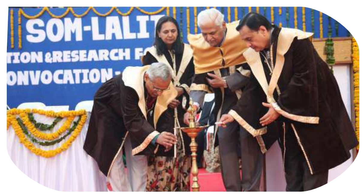
Hon'ble Justice Shri. Anil R. Dave, Former Judge, Supreme Court of India